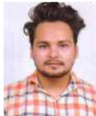
CHETAN KAUSHIK DOTT KHETRAPAL NURSING HOME