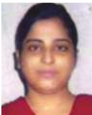
SAMYA BE COURSE:-MMLT, TMU CAMPUS