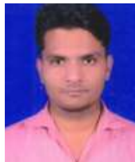
UMESH BMLT MAX LAB HOSPITAL, NOIDA