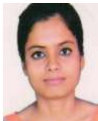
KHUSHBOO BMLT BHATIA GLOBAL HOSPITAL & ENDOSURGERY INSTITUTE