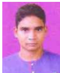
HEMAYATUL ISLAM BMLT B.K JAIN DIAGNOSTIC & RESEARCH INSTITUTE