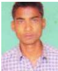
DWARKA PRASAD BMLT AIIMS HOSPITAL