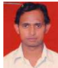
SHYAM SUNDER DOT SHYAM OPTICALS