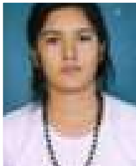
SARITA DMLT RML HOSPITAL