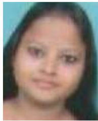
RASHMI COURSE:- BOOT VENU EYE INSTITUTE AND RESEARCH CENTRE