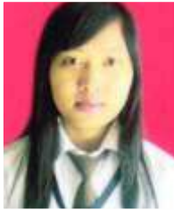
MUTUM RODA DEVI BOTT NIMS HOSPITAL, JAIPUR