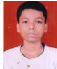
BRONIK DMLT RML HOSPITAL