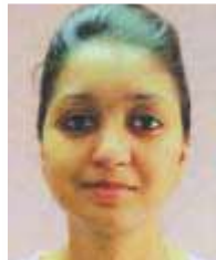
SAHEEN DMLT AIIMS HOSPITAL DELHI